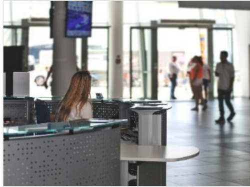
In entrance areas of public buildings