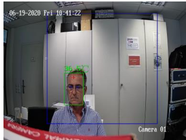
Measurement of body temperature by means of thermal imaging camera