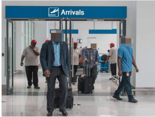
In public areas, e.g. airports