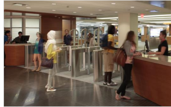
In connection with access control systems